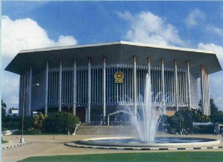
Bandaranaike Memorial International Conference Hall (BMICH) Colombo - Sri Lanka

An Emerging Market & Gateway to South Asia