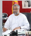
HON. DOUGLAS DEVANANDA

Minister of Traditional Industries & Small Enterprise Development