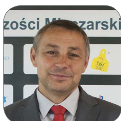
Piotr Szajner Institute of Agricultural and Food Economics - National Research Institute