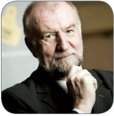
prof. Andrzej Babuchowski Minister - Counsellor, Permanent Representation of the Republic of Poland to the European Union