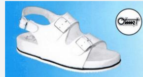
Model: 107SP Price 19,75 €