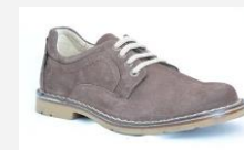
Model: 548 FO/FP Price: 36,50 € / 36 €