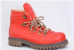
Model: WZ 012