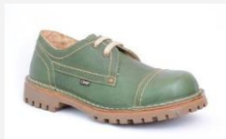
Model: 264 DP Price: 29 €