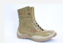
Model: 298 DP/DO Price: 31,50 € / 32,75 €