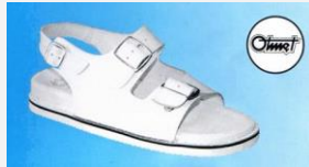
Model: 101SP Price: 21 €