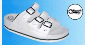
Model: 109SP Price: 20,25 €