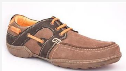
Model: WZ 017