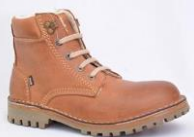
Model: 419 CO/CP 420 CO/CP Price: 32,50 € / 31,25 € 34 € / 32,75 €