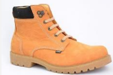
Model: 447 FP/FO Price: 33 € / 34,25 €