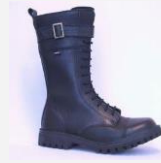
Model: 393 DO Price: 35,25 €