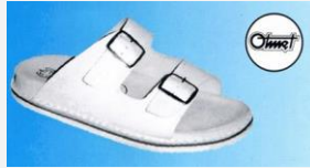
Model: 103SP Price: 20,50 €