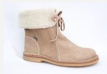
Model: 620 FO Price: 39 €