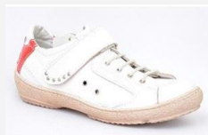
Model: WZ 014