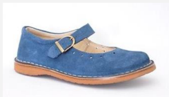
Model: 398 AP