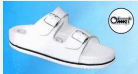
Model: 108SP Price: 20 €

Womans's models: 109,110,105 size: 36-42