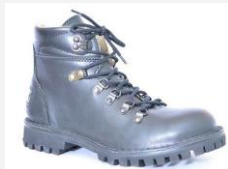
Model: 224 DP/DO Price: 33 € / 33,50 €