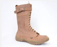
Model: 300 FO/FP Price: 40,25 € / 39 €