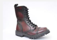
Model: 141 DO/DP 143 DO/DP Price: 35,25 € / 34,25 € 35 € / 36 €