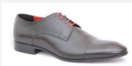
Model: WZ 010