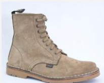
Model: WZ 022