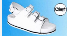
Model: 110SP Price: 20,50 €