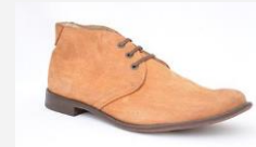
Model: 023 FP Price: 35,25 €