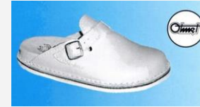
Model: 106SP/105SP Price: 21,50 € / 21 €