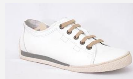
Model: WZ 021