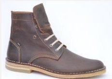
Model: WZ 013