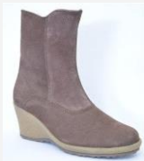
Model: WZ 019