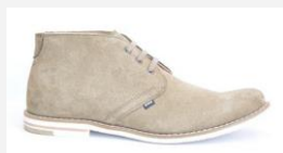
Model: WZ 024