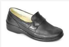
Model: 267 DP