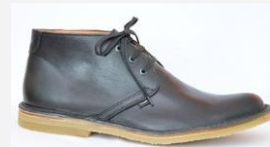
Model: WZ 027