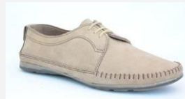
Model: WZ 028