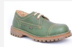
Model: 264 DP Price: 29 €