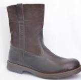
Model: WZ 029