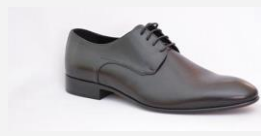
Model: WZ 002