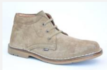
Model: 744 A5 Price: 26,50 €