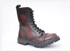
Model: 141 DO/DP Price: 35,25 € / 34,25 €