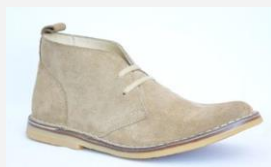
Model: WZ 026