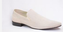
Model: WZ 003