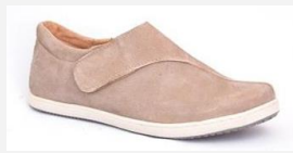
Model: WZ 016