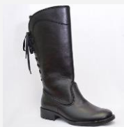
Model: WZ 011