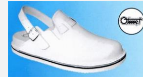
Model: 390SP/391SP Price: 22,25 € / 22,75 €