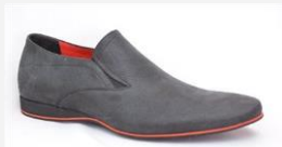
Model: WZ 007