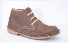
Model: 482 F5