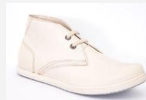
Model: 483 DP