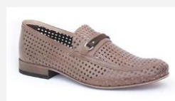
Model: WZ 008