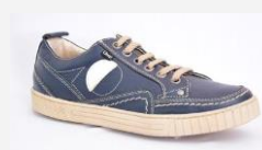
Model: 438 DP Price: 32,75 €