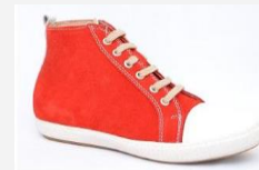
Model: WZ 015