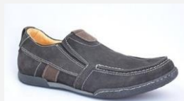
Model: WZ 018