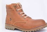
Model: 420 CO/CP Price: 34 € / 32,75 €