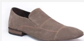
Model: WZ 004