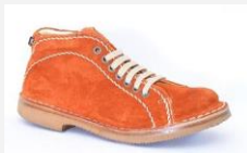
Model: 437 A0/AP Price: 26,50 € / 25,25 €