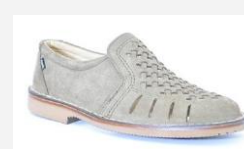
Model: 350 AP Price: 25,50 €