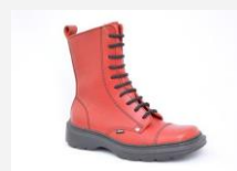
Model: 128 DO/DP Price: 34 € / 32,75 €