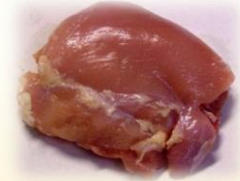
95% Lean Skinless Chicken Thigh