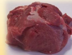
80% Lean Whole Muscle Pork