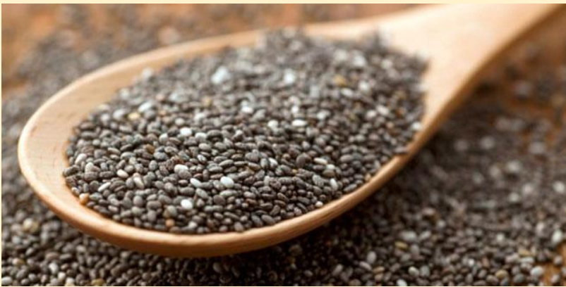
Flours & Meals