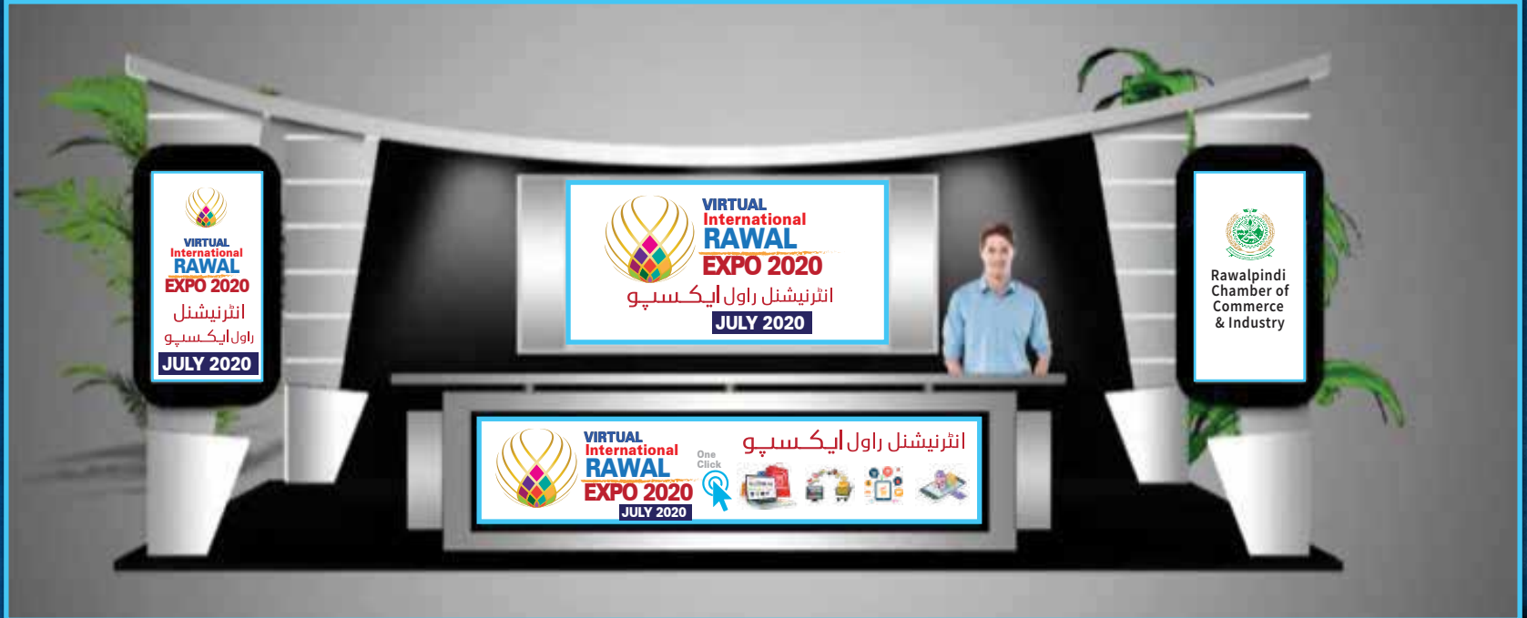
IMAGE | VIDEOS | MAP | VIRTUAL BRIEFCASE | BROCHURES | CHAT | VIDEO CHAT