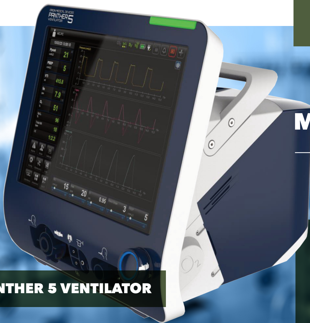
PANTHER 5 VENTILATOR

CELITRON MEDICAL TECHNOLOGIES is supporting the fight against