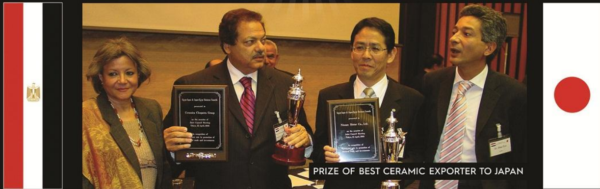
PRIZE OF BEST CERAMIC EXPORTER TO JAPAN