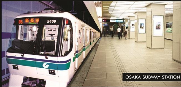
OSAKA SUBWAY STATION