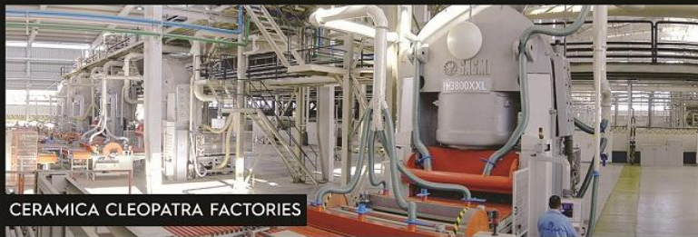
CERAMICA CLEOPATRA FACTORIES