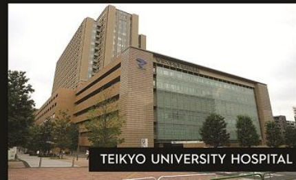
TEIKYO UNIVERSITY HOSPITAL