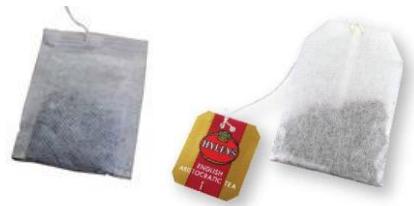
Single & Double Chamber String & Tag Tea Bags