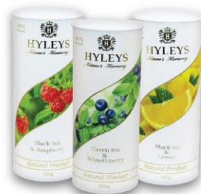
Loose Tea in Paper / Composite Cans