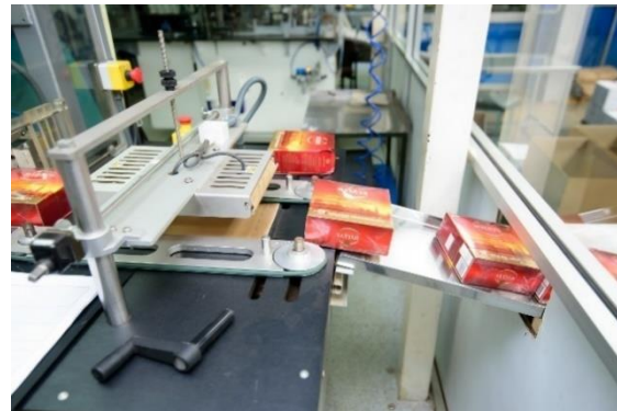
Automated Packing Lines