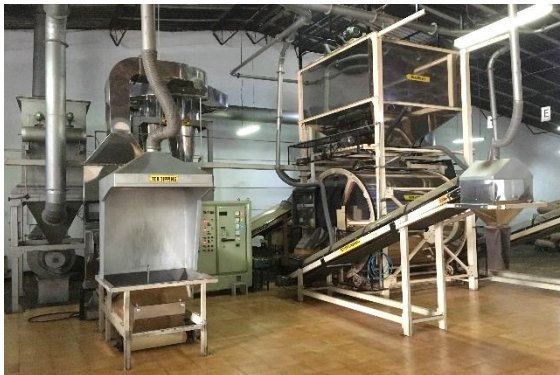
Tea Cleaning Machinery