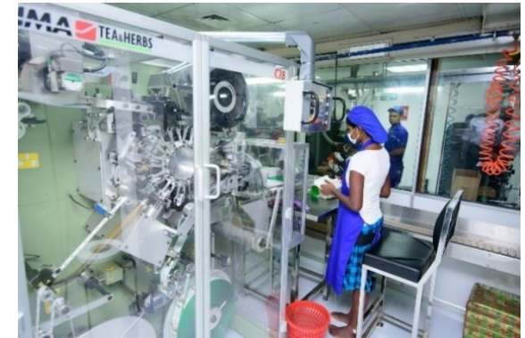
Tea Bagging Machinery