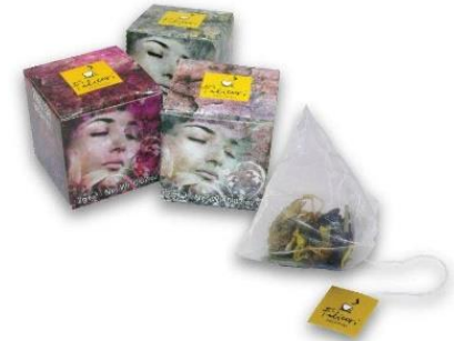
Pyramid Tea Bags in Individually Packed Cartons