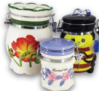
Loose Tea in Ceramics