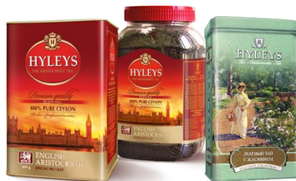
Loose Tea in Tins & Jars