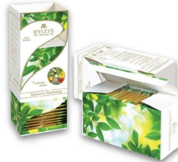
Easy Open Cartons