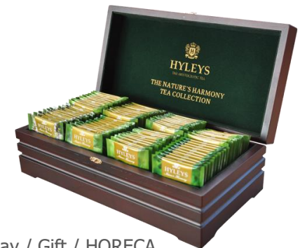
Display / Gift / HORECA Wooden Boxes