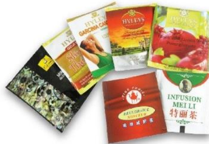
Staple Free Individually Wrapped Foil Envelopes