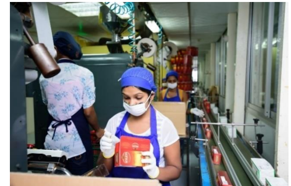
Emphasis on Quality & Food Safety