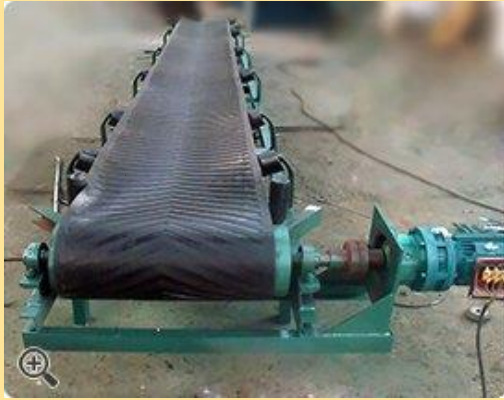
Conveyer belt 1