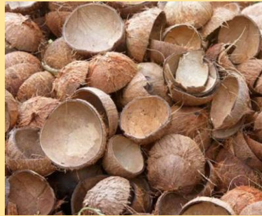
Dry coconut shell