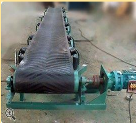
Conveyer Belt 2