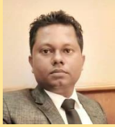
The Director Production & Quality