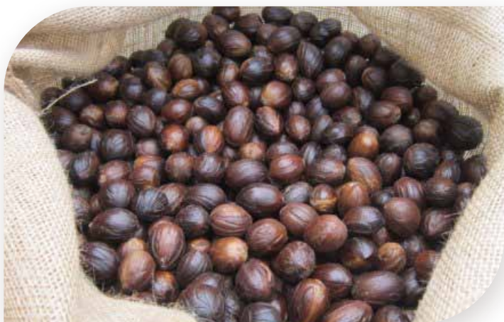
NUTMEG WITH SHELL