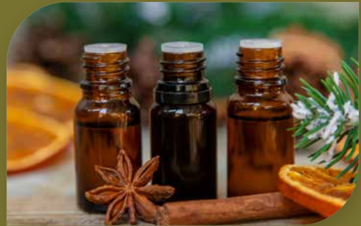
CINNAMON BARK OIL