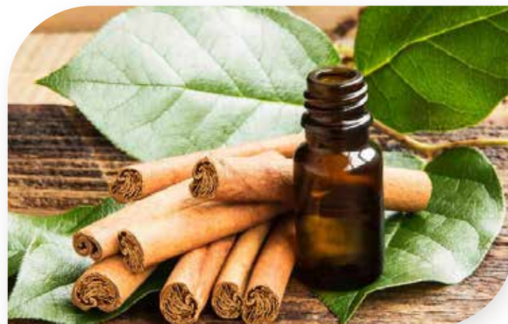
CINNAMON LEAF OIL