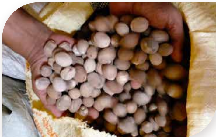
NUTMEG WITHOUT SHELL