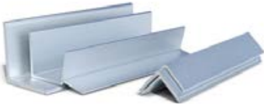
Equal Angle and Unequal Angle