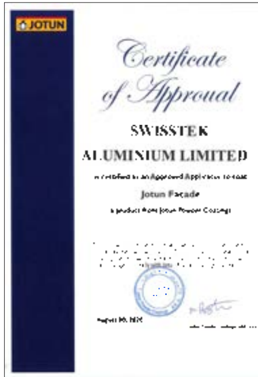
Jotun Approved Applicator Certificates