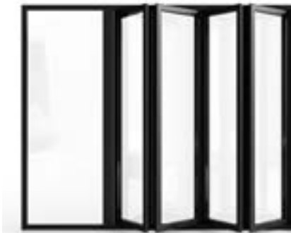
Sliding folding doors