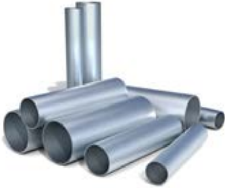
Round Pipe and Plate