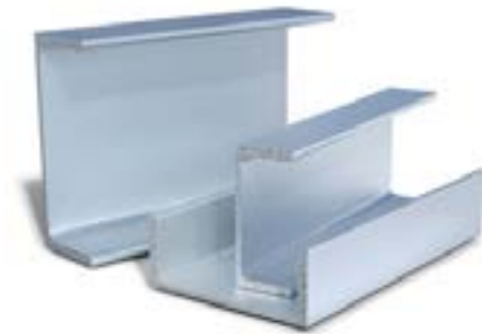
Single Channel and Double Channel