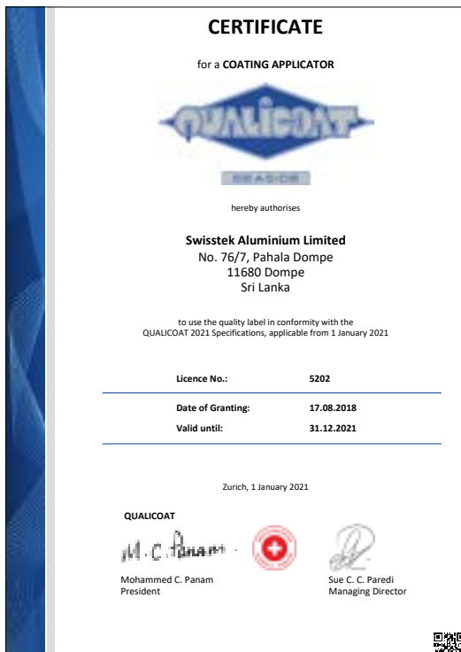
Qualicoat Sea Side