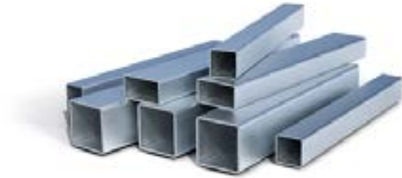
Rectangular Pipe and Square Pipe