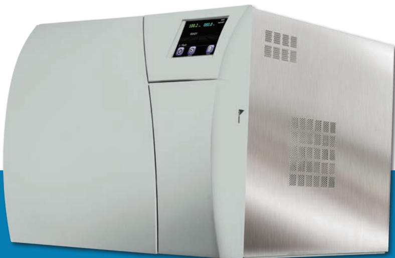
Sting 11B Premium