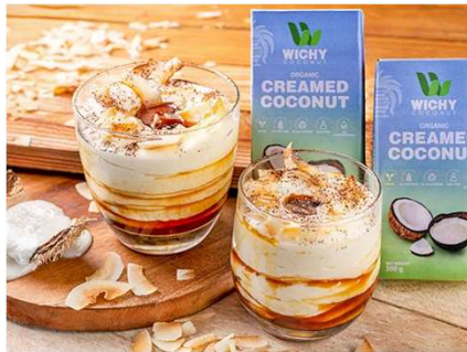
ORGANIC CREAMED COCONUT