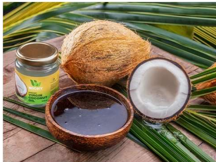
ORGANIC VIRGIN COCONUT OIL