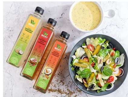
ORGANIC COCONUT VINEGAR REGULAR/CHILLY/SPICED