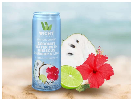
ORGANIC COCONUT WATER WITH HIBISCUS SOURSOP & LIME