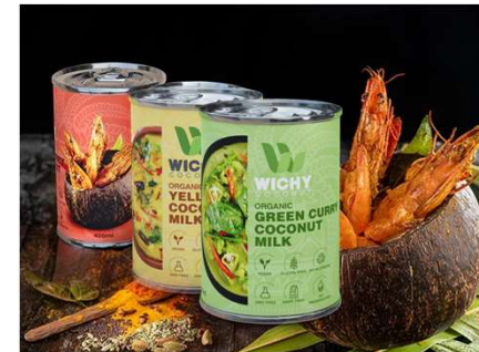
ORGANIC GREEN/YELLOW/ RED CURRY COCONUT MILK