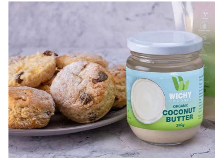
ORGANIC COCONUT BUTTER