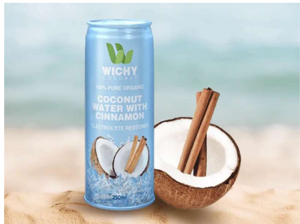
ORGANIC COCONUT WATER WITH CINNAMON