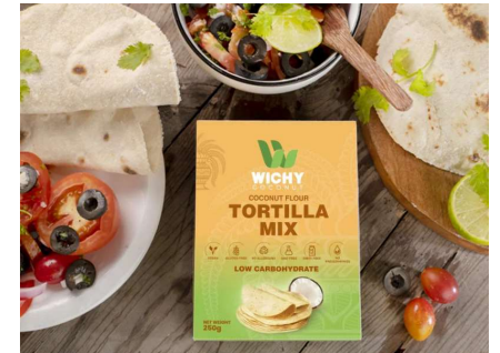
COCONUT FLOUR TORTILLA MIX