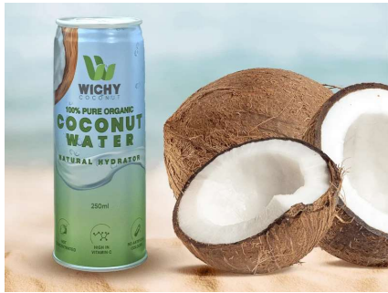
ORGANIC COCONUT WATER