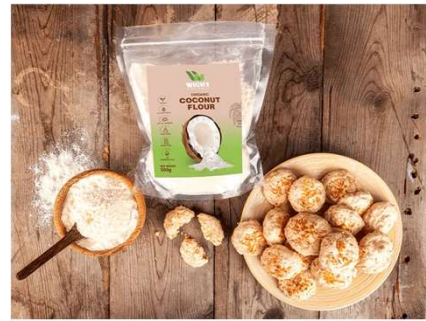
ORGANIC COCONUT FLOUR