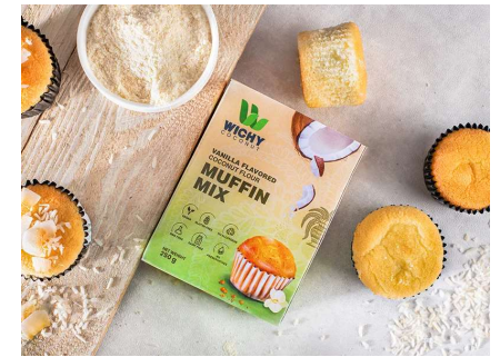
VANILLA FLAVOURED COCONUT FLOUR MUFFIN MIX