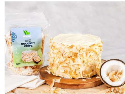
ORGANIC RAW COCONUT CHIPS