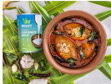
ORGANIC COCONUT MILK