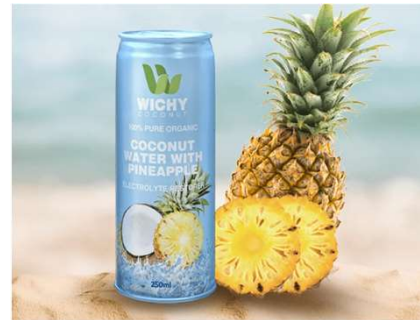
ORGANIC COCONUT WATER WITH PINEAPPLE