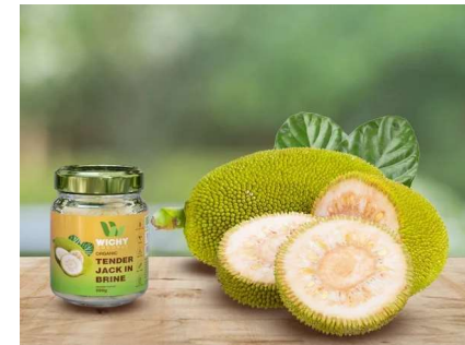
TENDER JACK IN BRINE