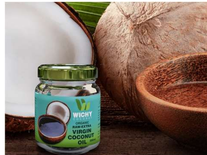
RAW EXTRA VIRGIN COCONUT OIL