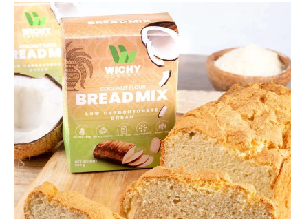
COCONUT FLOUR BREAD MIX