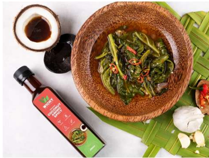
ORGANIC COCONUT AMINO SPICY