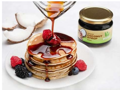
ORGANIC COCONUT SYRUP