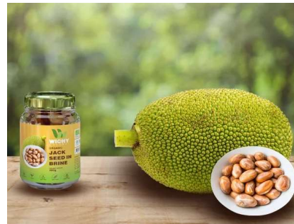
JACK SEED IN BRINE