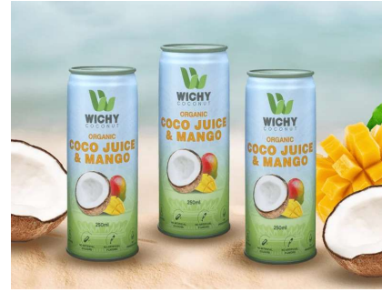
ORGANIC COCO JUICE & MANGO