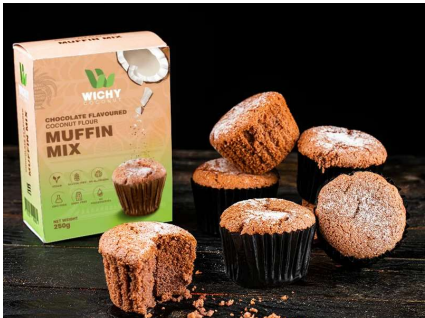
CHOCOLATE FLAVOURED COCONUT FLOUR MUFFIN MIX