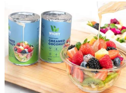
ORGANIC CREAMED COCONUT