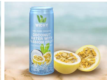
ORGANIC COCONUT WATER WITH PASSION FRUIT