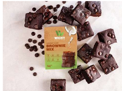
COCONUT FLOUR BROWNIE MIX