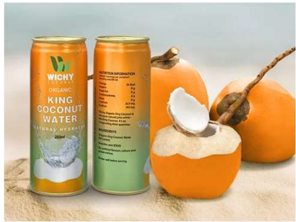
ORGANIC KING COCONUT WATER