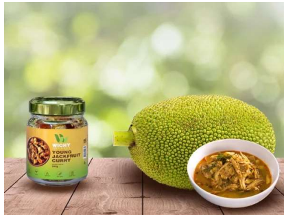
YOUNG JACKFRUIT CURRY