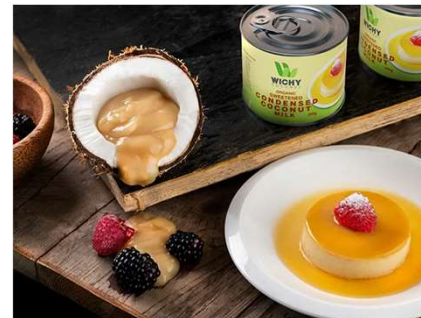
ORGANIC SWEETEND CONDENSED COCONUT MILK