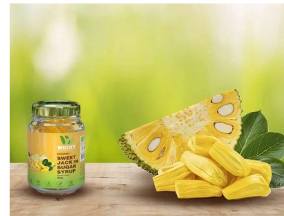
SWEET JACK IN SUGAR SYRUP