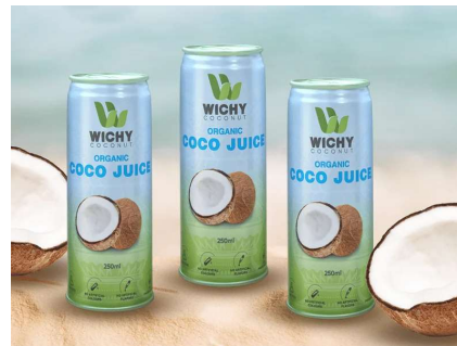
ORGANIC COCO JUICE