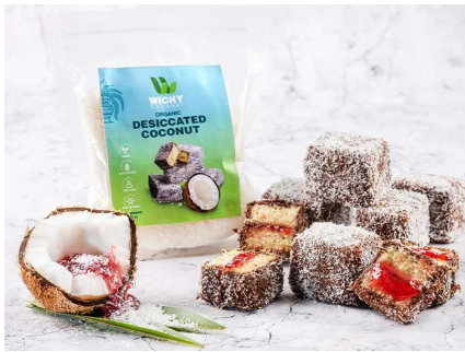
ORGANIC DESICCATED COCONUT