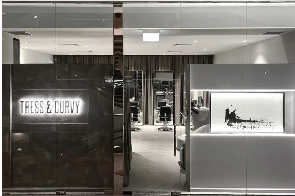
Model 01 Franchise Tress & Curvy Salon