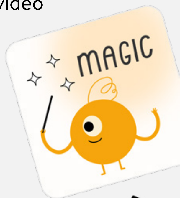
Evaluate students' progress with stickers

With Redmenta teachers can create worksheets that facilitate research work and enable students to create mood or concept boards. They can also utilize the platform to setup algorithms or family trees using flowcharts, design or sketch their ideas, and even record video presentations. With Redmenta, students have the opportunity to engage in peer or group reviews, unlocking their full potential.