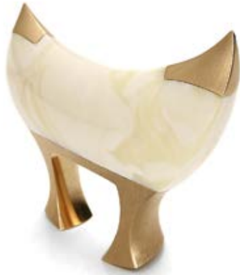
Less than white