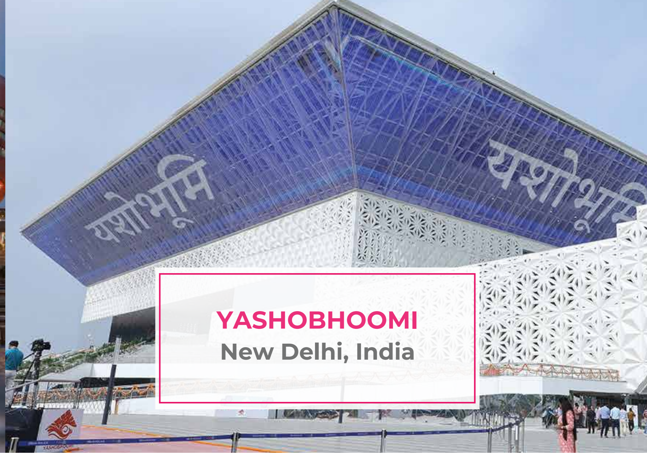
YASHOBHOOMI New Delhi, India