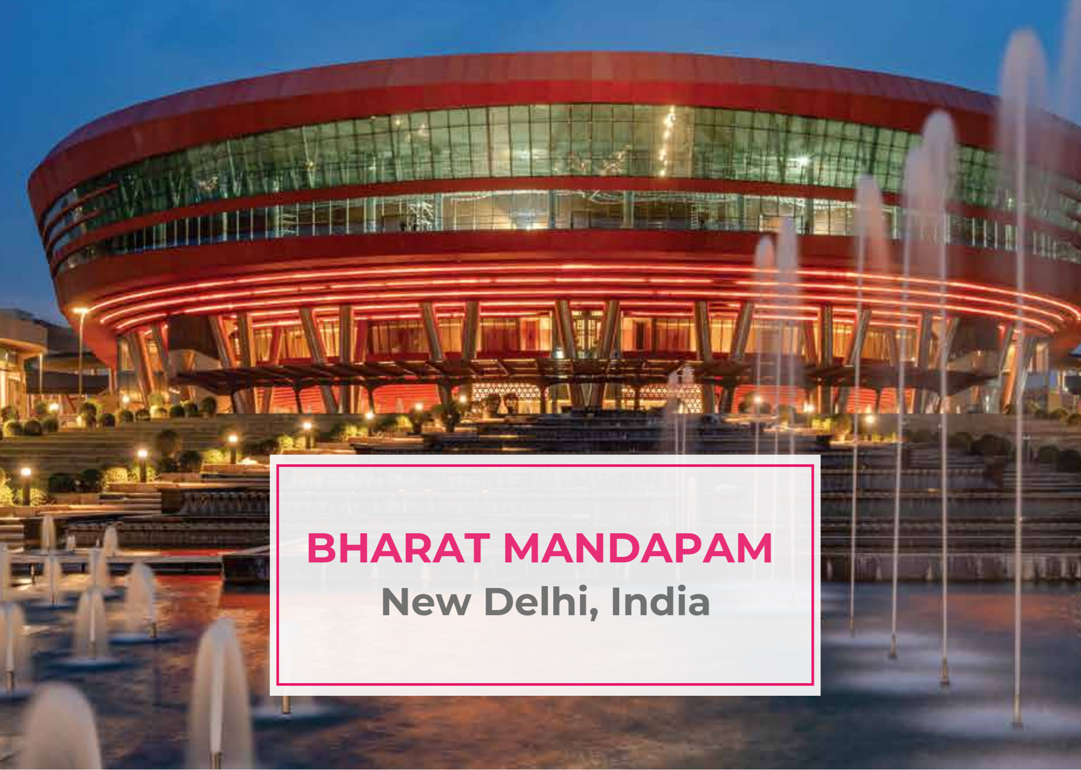
BHARAT MANDAPAM New Delhi, India