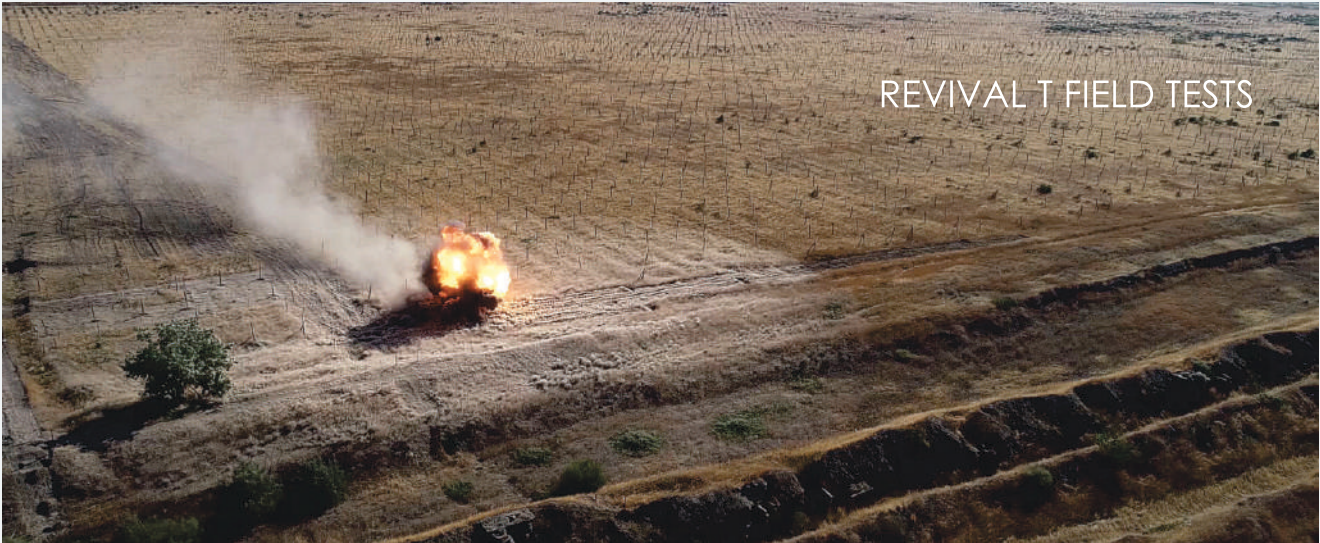
EXPLOSION OF TM - 62 ANTI-TANK MINE (8 KG TNT)