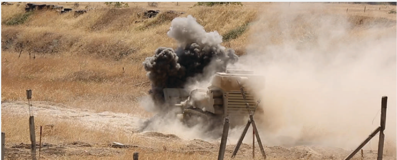
EXPLOSION OF TM -57 ANTI-TANK MINE (6,5 KG TNT)