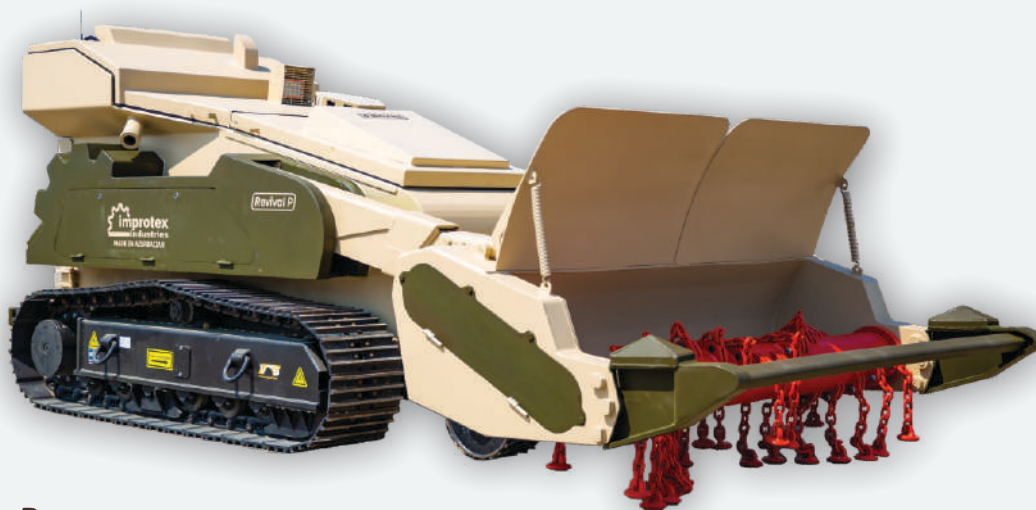
REVIVAL P ANTI-PERSONNEL DEMINING EQUIPMENT