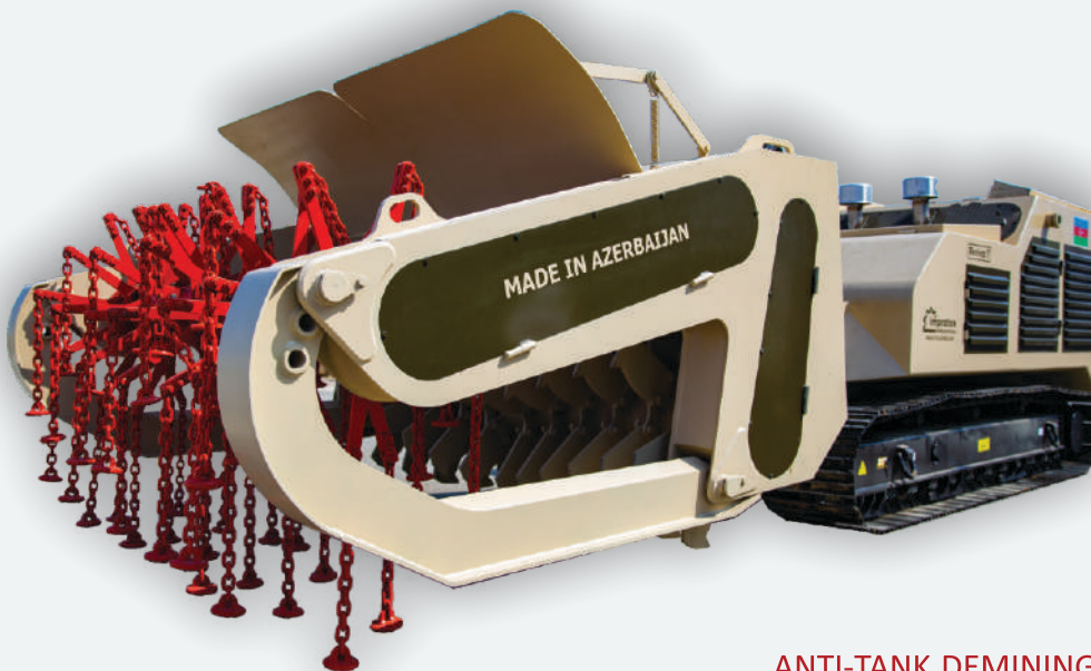
REVIVAL T ANTI-TANK DEMINING EQUIPMENT