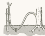
Layering Technique "Mugrones"