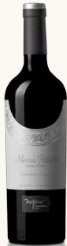
Signature Cabernet Franc