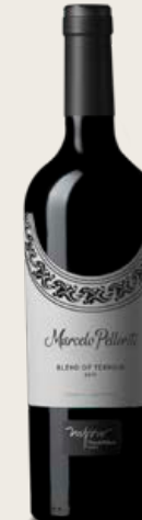
Blend of Terroir