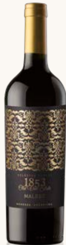
Selected Parcel Malbec