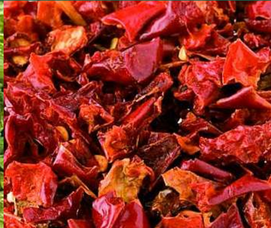
DEHYDRATED RED BELL PEPPER (SWEET)