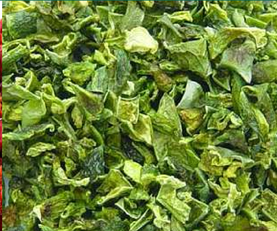
DEHYDRATED GREEN BELL PEPPER