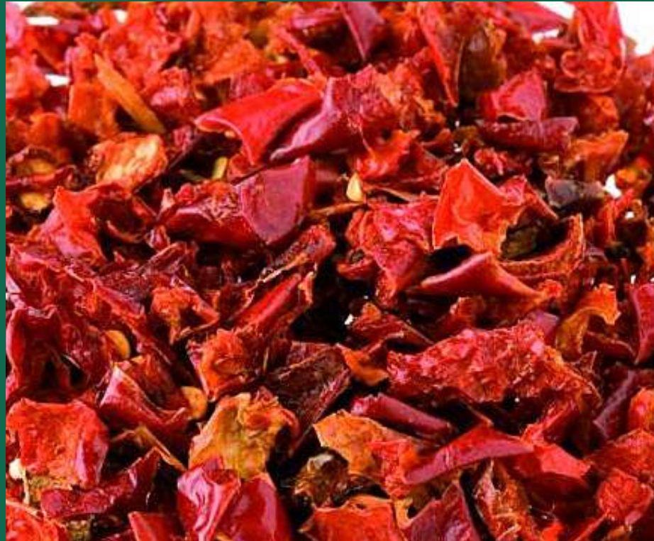
DEHYDRATED RED BELL PEPPER (SOUS)