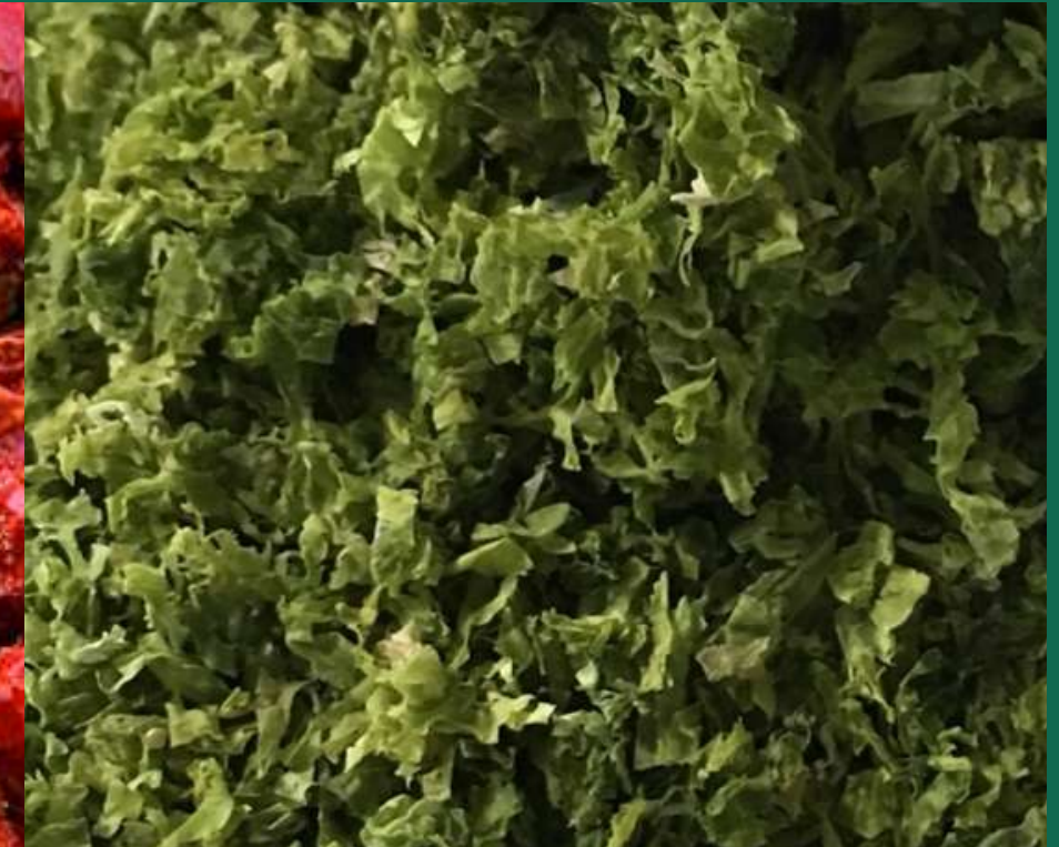
DEHYDRATED YELLOW BELL PEPPER