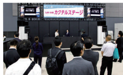
Eligible Products | Shochu, sake, wine, etc. (from Kyushu)

A famous Kyushu bartender will suggest new ways to drink sake, shochu, and more