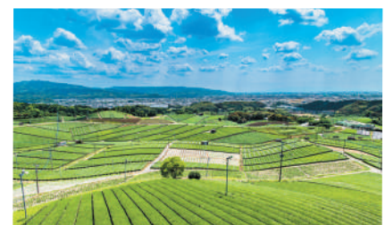
Eligible Products | Chiran tea, Yame tea, Ureshino tea, etc. (from Kyushu)

Tea masters and tea farmers suggest delicious ways to drink Kyushu-grown Japanese tea